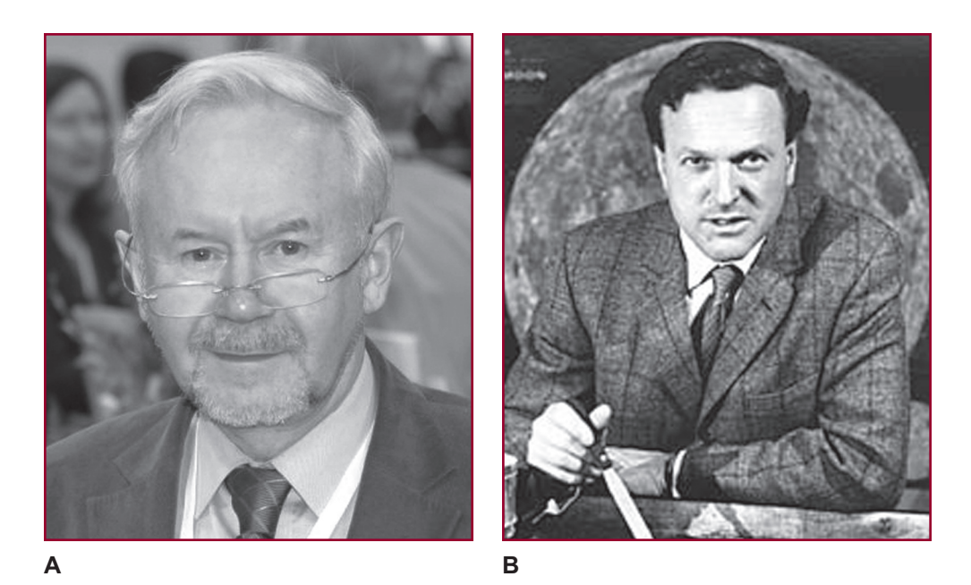
FIGURE 1–2. David Kemp, the British physicist who discovered otoacoustic emissions ( A ) and Thomas Gold, the British physicist who in the late 1940s recognized the nonlinear nature of the cochlea ( B ).

The theme in this passage, however, accurately reflects the approach taken by Gold in the late 1940s when he challenged predominant theories