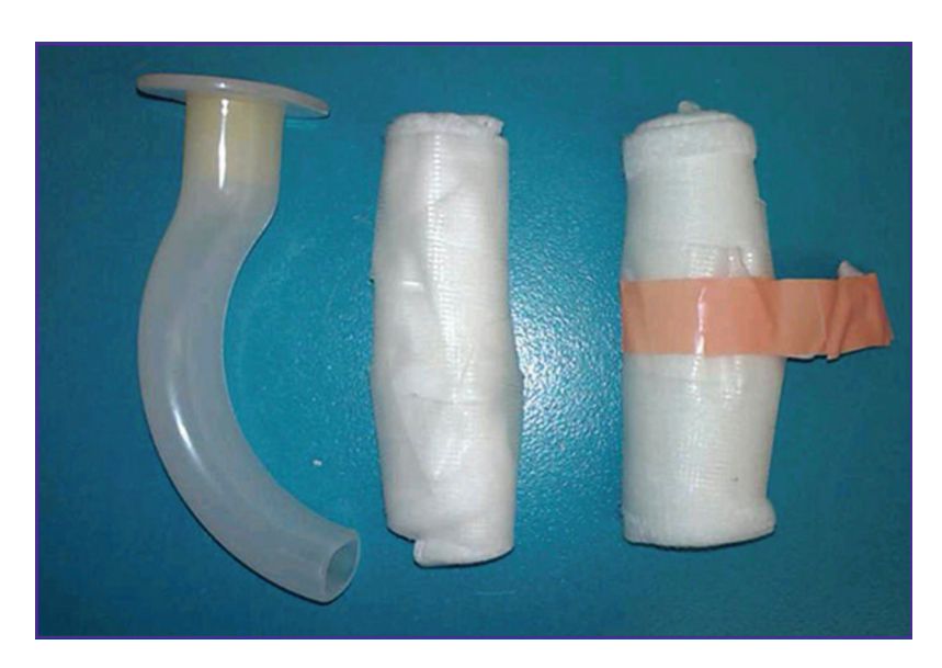
Figure 1–1. Examples of bite blocks used by anesthesiologists during general anesthesia. The variable size, omission from surgical counts, and lack of radiological markings make hand-made bite blocks a potential airway foreign body.

that was taped together. This was originally placed by one anesthesiologist at the beginning of surgery upon intubation. About halfway through the surgical case, a second anesthesiologist relieved the first anesthesiologist and proceeded to finish the surgical case. The bite block most likely had become displaced between the start of the surgical case and the second anesthesiologist taking over. The second anesthesiologist did not know that there was a bite block and would not have been aware that it had become displaced from its original location.